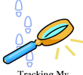
Tracking My Ancestors

Come to the library and learn how to research your family history using Ancestry Library Edition as well as Family Currier Museum of Art Search. Please register.